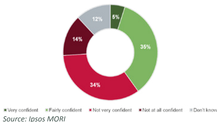
Figure 3: ‘Currently, the UK’s intelligence agencies are held to account on behalf of the public by a committee of politicians. How much confidence, if any, do you have in the current system of holding the intelligence agencies in the UK to account?’

these agencies’. 36 These criticisms over its membership, outputs and degree of independent scrutiny have contributed to the deficit in public confidence, as illustrated by an Ipsos MORI survey from May 2014, shown in Figure 3.